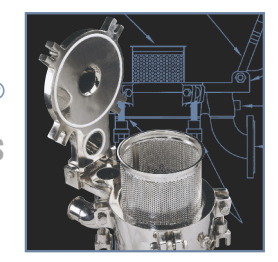
Over-The-Top ® Design Filter Housings

Over-The-Top® Design Liquid Filter Housings